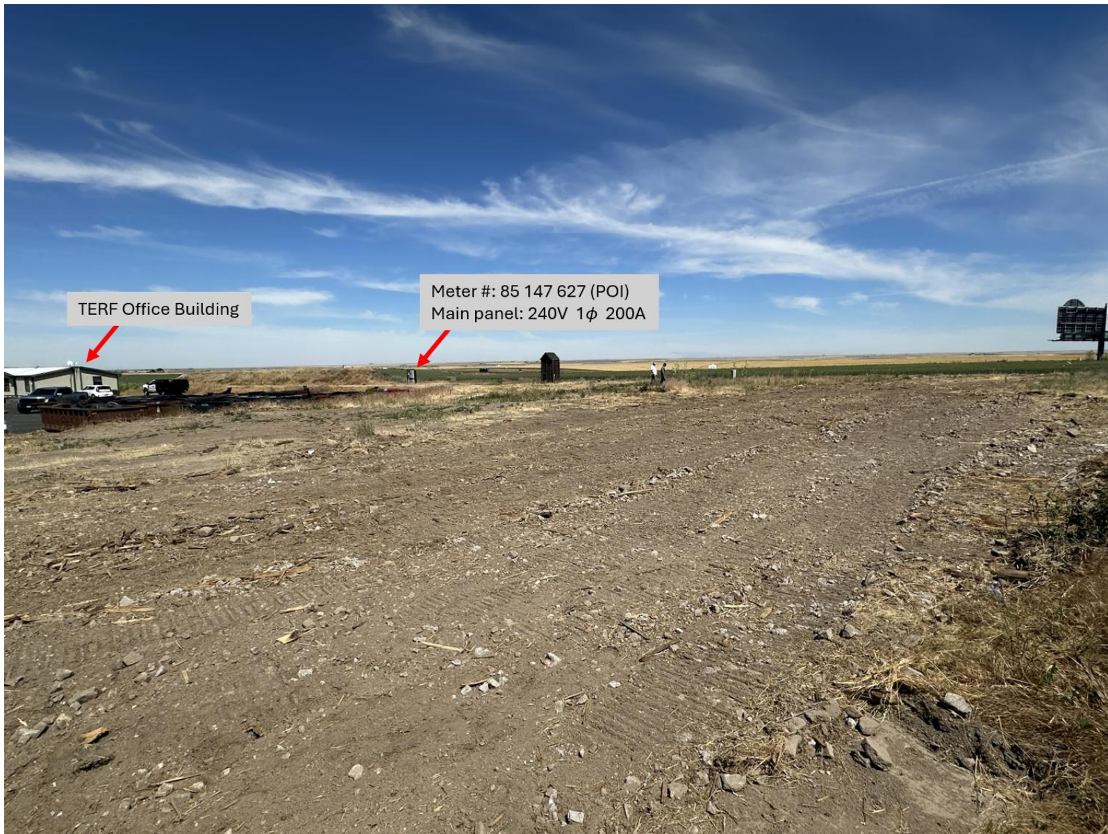
Figure 3: Recent photo of solar PV system installation area at the TERF taken following the completion of site clearing activities.