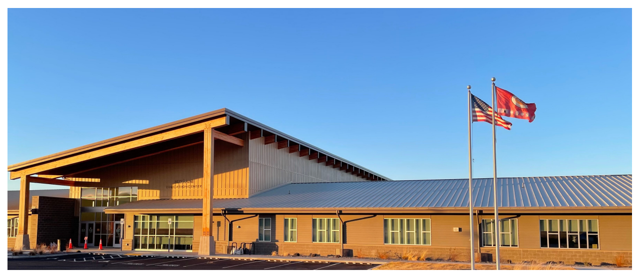
Nixyáawii Education Center